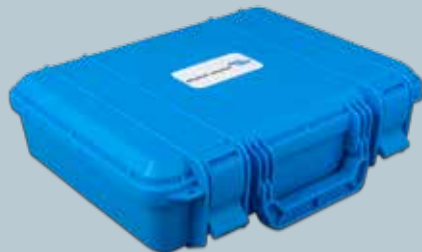
Carry Case for Blue Smart IP65 Chargers and accessories