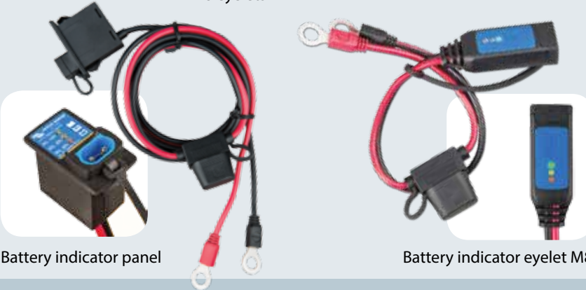
Battery indicator panel