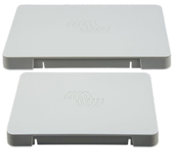
GX Touch 50 & 70 protective plastic cover